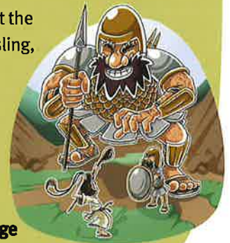
Bible story based on 1 Samuel 17

This was a day no-one would forget, when the courage of a shepherd boy saved a nation.